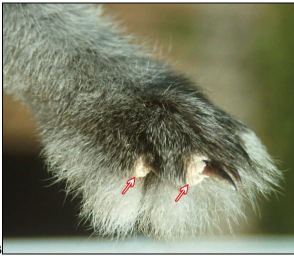
Figure 2 : Fungal infection affecting the digits and pads (A) and digits infested by Sarcoptes scabiei (B) (Pictures: Pamela Alley and I. Aizenberg).

www.medirabbit.com info@medirabbit.com 2