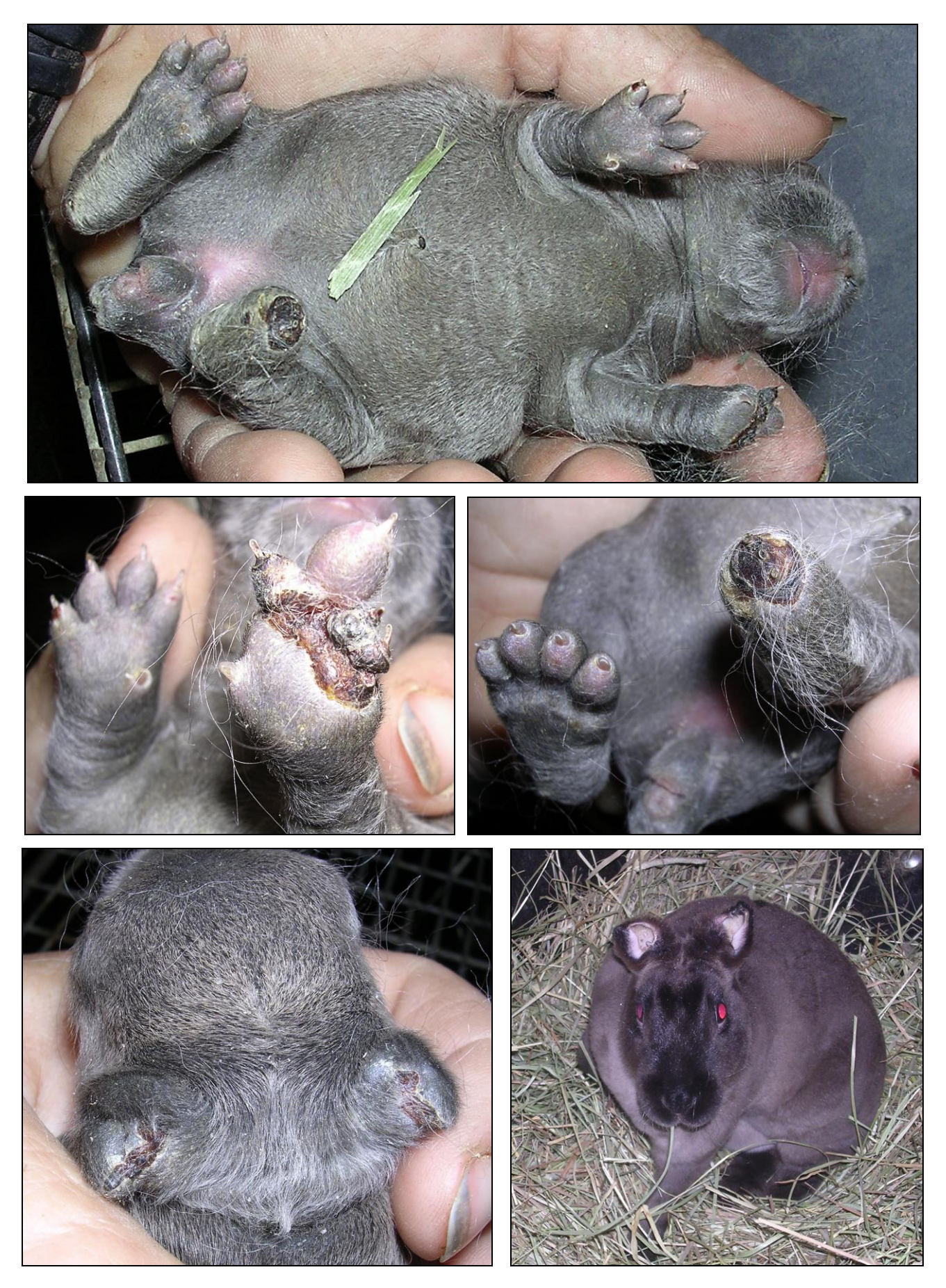
Figure 5: One of the rabbit kits in Figure 4 has been severely mutilated by the doe. Details of the mutilation on the head, ears, forelimb and hind limb. This rabbit survived the lesions and has grown into an adult rabbit (Photos: Pamela Alley).