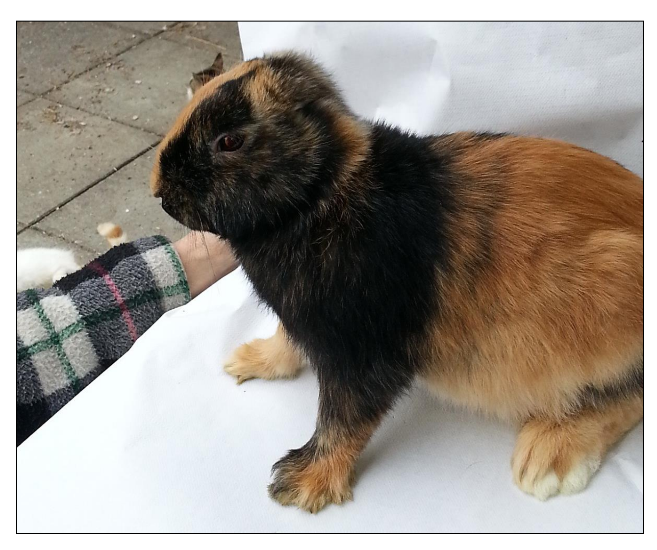
Figure 1 : Young, healthy and active Harlequin rabbit lacking ears after excessive licking by the doe.

with a very strong maternal instinct (Figure 1) as well as in individuals belonging to inbred rabbit colonies. It is,