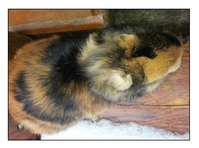
Figure 7: Young Harlequin rabbit of Figure 1 whose ear pinnae have been fully amputated: head and dorsal view.

Castration of a male rabbit helps eliminate sexual frustration and avoids false pregnancies in females. Neutering also helps stop unwanted behavior in male rabbits such as marking of their territory and urine squirting on furniture and walls.