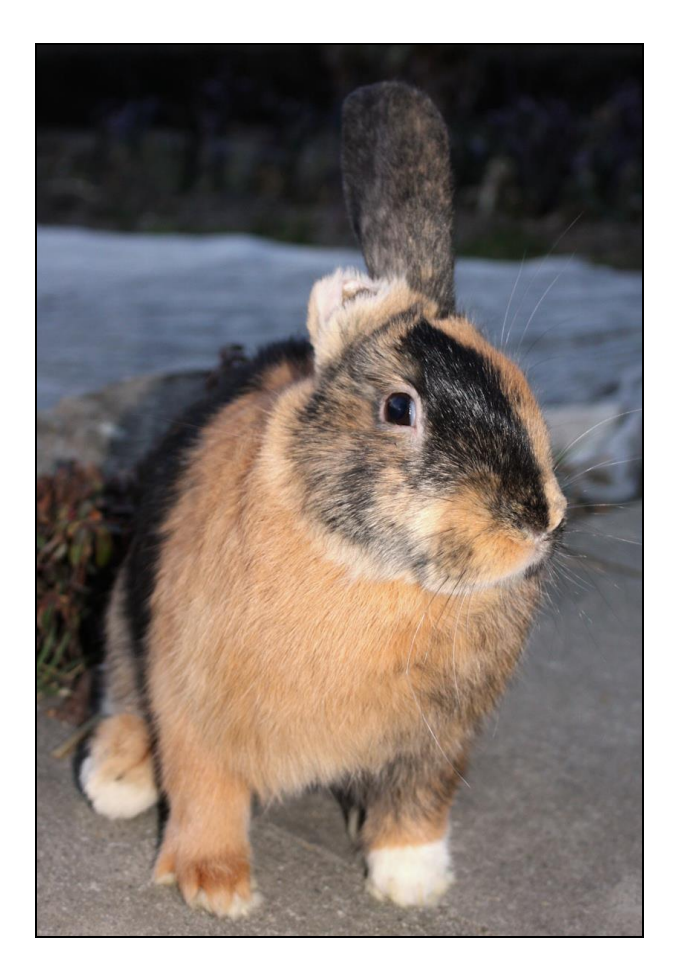
Figure 6: The degree of mutilation of the ear pinna varies from one victim to another. Few have a remainder, like here, with this Harlequin rabbit.

Boredom can be easily resolved by providing possibilities that increase the curiosity of rabbits, to enable exercise and investigation of their living environment and by giving stimulating toys (cardboards, tunnels, branches to eat, hay, straw).