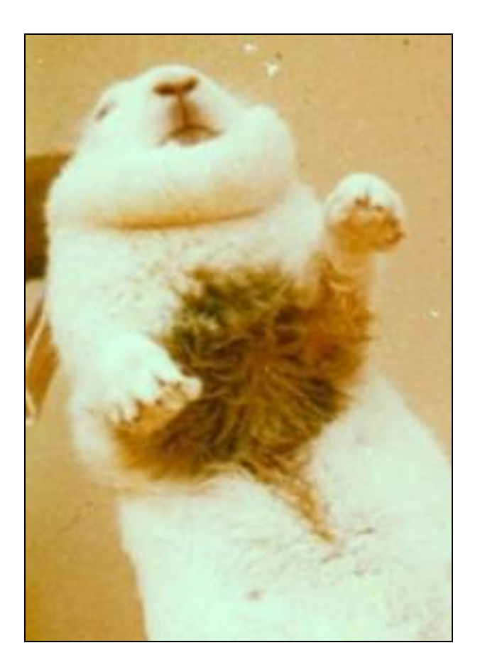
Figure 3: Rabbit suffering from a Pseudomonas infection, caused by a defect watering system.

localized and diffuse. The skin is erythematous and moist. Deep ulcers or abscesses may rarely be observed. A secondary bacterial infection is possible if the Pseudomonas dermatitis is not treated, with the development of cutaneous abscesses.