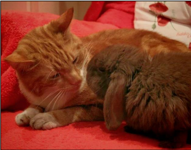
Figure 3: Friendship between a cat and a rabbit comes at the price of a strict hygiene.

Wild and domestic rabbits and a few hare species infested by Toxoplasma sp. have been found all around the world (Cox et al., 1981 ; Dubey et al., 2011 ; Gustafsson et al., 1997a, b, 1997a ; Kapperud, 1978 ; Lainson, 1955). The anthro-po-zoonotic transmission potential of the parasite could not be established with certainty to this day, and should not be minimized. Indeed, a pet rabbit with facial and cervical masses and a high titer for anti-toxoplasma antibodies is suspected to have transmitted cervical toxoplasmosis to its owner (Ishikawa et al., 1990). High levels of anti-toxoplasma antibodies have also been detected in hunters of wild rabbits and hares (Beverley et al., 1976). Further studies suggest that farm rabbits suffering from toxoplasmosis of the central nervous system may have transmitted the parasite to persons who took care of them (Sroka et al., 2003). It remains, however, hard to establish a direct link between rabbits and man when cats are sharing the same environment than rabbits. (Figures 1, 2, 3, 4, 5).