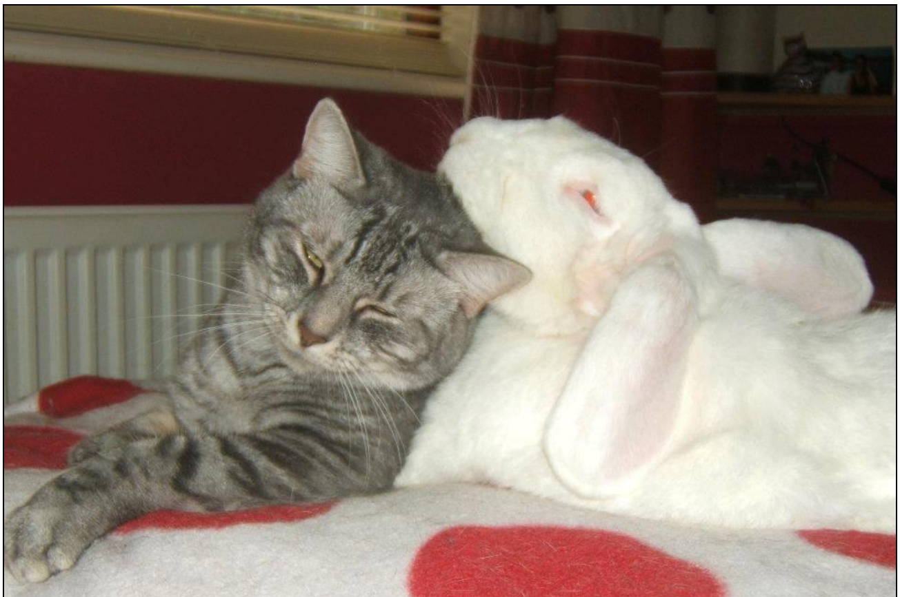
Figure 1: Even when cohabitation between a cat and a rabbit is excellent, there is a risk of transmission of the toxoplasmosis parasite

toxoplasmosis. He named it Toxoplasma sp. due to its crescent shape: "toxon", Greek for crescent, and "plasma" meaning shape.