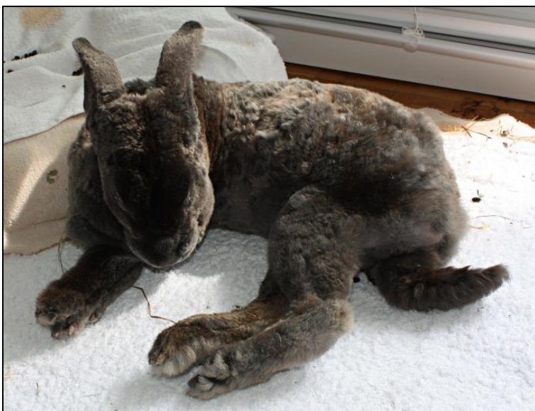
Figure 7 : Rabbit suffering from an epilepsy-like attack.

and pyrexia (over 41°C / 105.8°F). Rabbits refuse to drink and get dehydrated. Breathing rate is rapid (tachypnea). Eyes and nose may have a sero-purulent discharge. These rabbits will develop tremor of muscles and shaking of the head. Rarely, the head is tilted to one side, but this is not characteristic of the infection. Voiding of urine may be painful (dysuria).