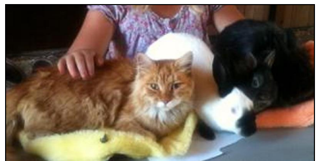
Figure 5: It is important to wash towels and pet beds regularly at high temperature to kill Toxoplasma oocysts.

Latent toxoplasma infection: Healthy and immunocompetent adult rabbits are seropositive for toxoplasmosis but remain asymptomatic during longer periods of time. The acquired immunity protects rabbits during their whole life. Cysts containing bradyzoites remain present in the tissues of the central nervous system. From time to time, cysts can rupture. The defense mechanisms of the immune system and the anti-toxoplasma antibodies enable control and limit the infections locally, hindering the spreading of bradyzoites throughout the body and the destruction of surrounding cells. The infection remains asymptomatic. During a necropsy, proliferation of supporting tissue of the central nervous system (gliosis) as well as granulomatous