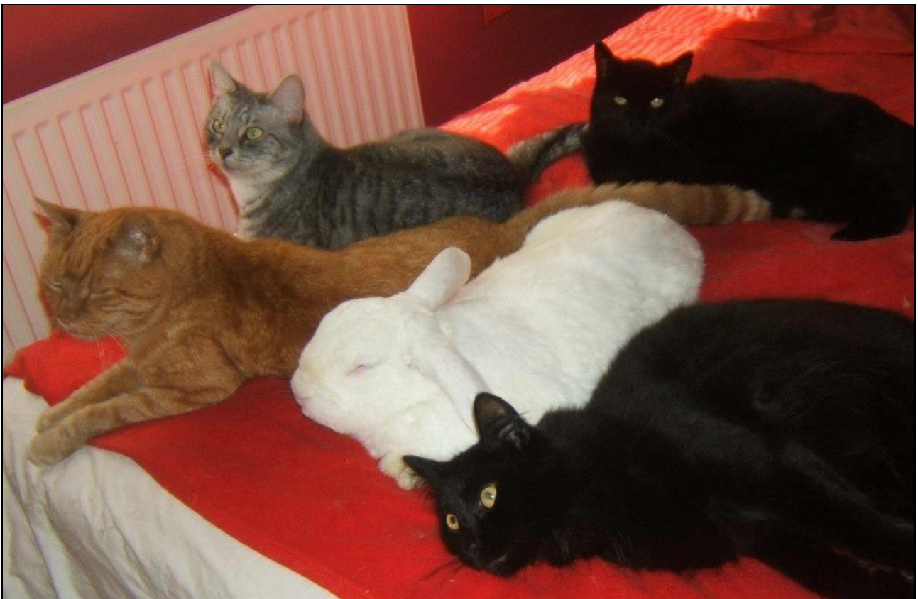
Figure 2: Cats are the definitive host of Toxoplasma gondii and free oocysts in its environment with feces, independently of living outside or inside.