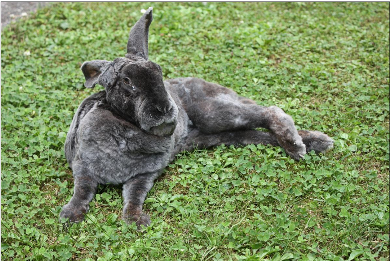
Figure 6: Toxoplasmosis and encephalitozoonosis present similar clinical signs in rabbits: weight loss in spite of a good appetite and paralysis of the hind limbs.

Acute toxoplasma infection : This form affects mostly younger rabbits and leads to death after 2 to 8 days post-infection. The first signs of the acute infection include a sudden lethargy with decreased appetite