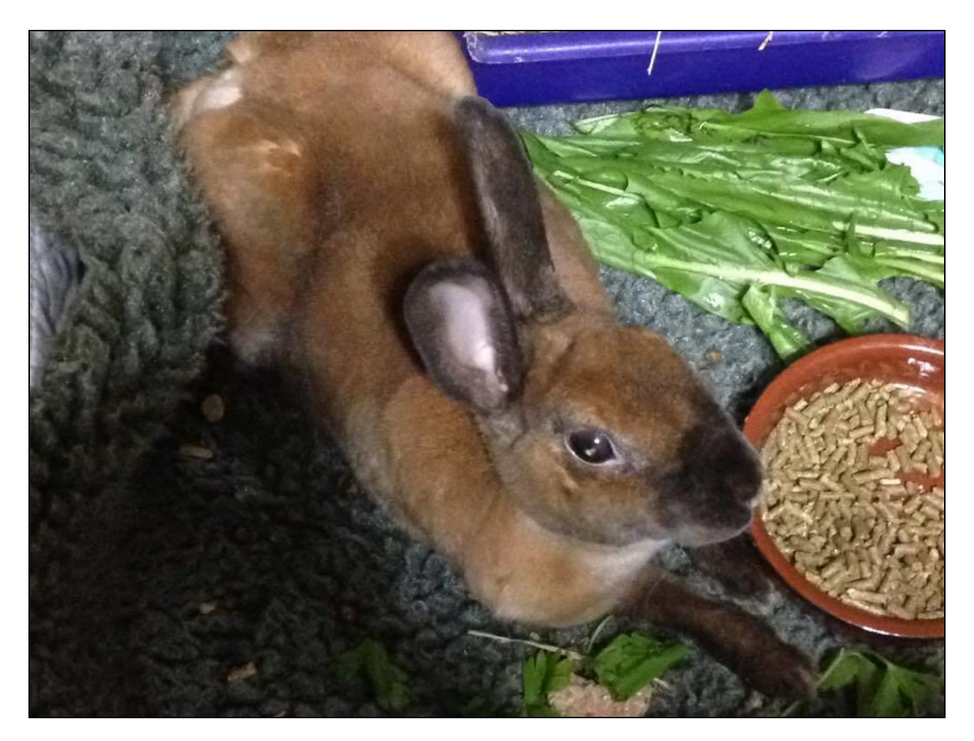
Figure 1 : Hope, a Rex rabbit estimated to be 1 year old. She developed numerous calcified masses suggesting osteosarcoma and an eye problem.

genetic material (e.g. irradiation), chronic irritation of the tissue (trauma), or the introduction of a foreign body into the system (e.g.: via vaccination, injection of