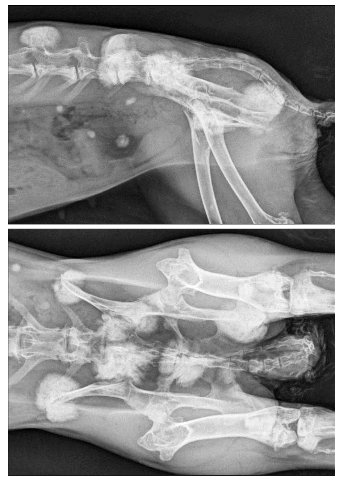
Figure 4 : More detailed views of the masses with sunburst pattern on the pelvis, on the spine and metastasis in the abdomen, the chest and the lungs. A biopsy suggests periosteal osteosarcoma.