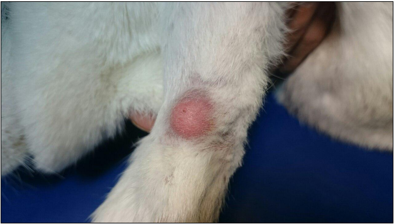
Figure 2 : Detail of the swollen joint of the front left limb of this rabbit.