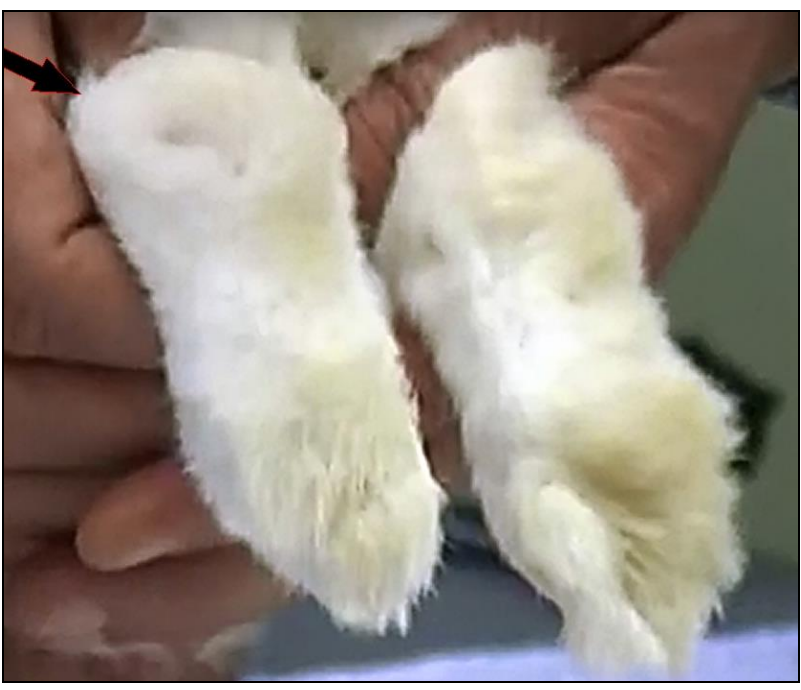
Figure 5 : Parker, young rabbit, whose left hind-limb (top) is swollen. It is also shorter (arrow) than his right one (bottom).