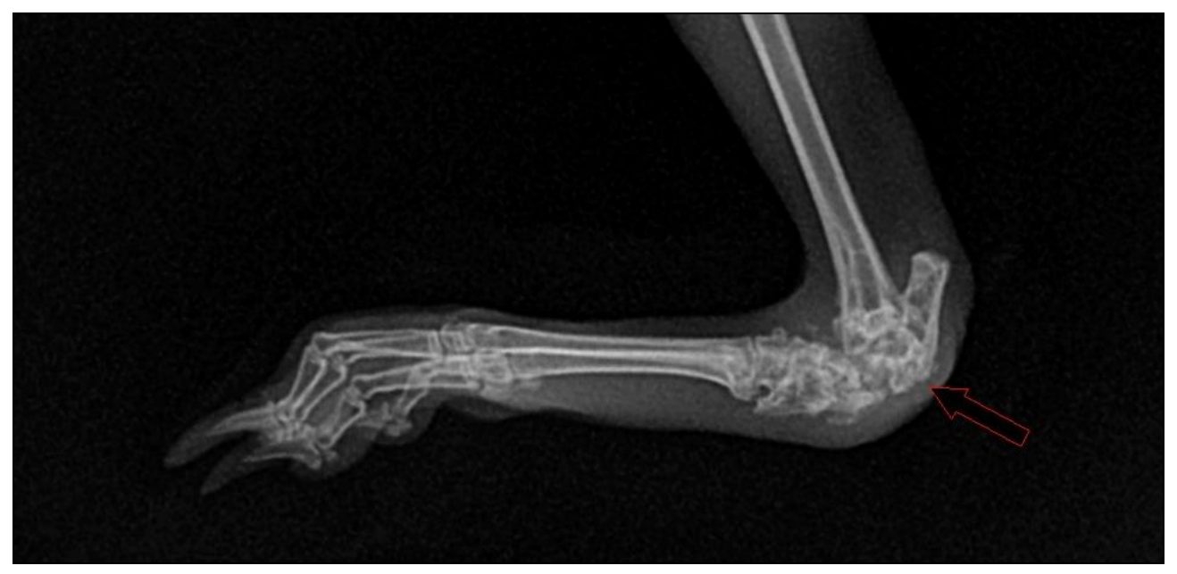
Figure 6 : X-ray of Parker's healthy right hind-limb, and of his swollen left, which shows the presence of septic arthritis accompanied by a fractured calcanea tuber (arrow) and a loss of bone structure in the joint.

A sample of the synovial fluid is taken under general anesthesia. The cytological analysis confirms the presence of bacteria in the joint (Figure 7) and confirms the diagnosis of septic arthritis.