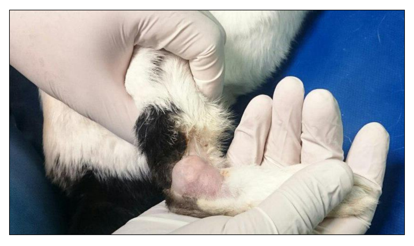
<u>Figure 4</u> : Tarsal joint bones of the hind limbs are also affected, here the right hind limb.

joint capsule (synovium) and the excision of infectious centers, abscesses and necrotic tissue. PMMA beads impregnated with an antibiotic are introduced into the intra-articular space and the cavity of the abscess. The choice of antibiotics depends on the result of the bacterial culture. The beads should be removed 4 to 6 weeks after surgery.