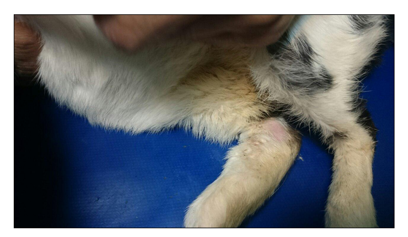
<u>Figure 3</u> : Tarsal joint bones of the hind limbs are also affected, here the inner side of the right hind limb.