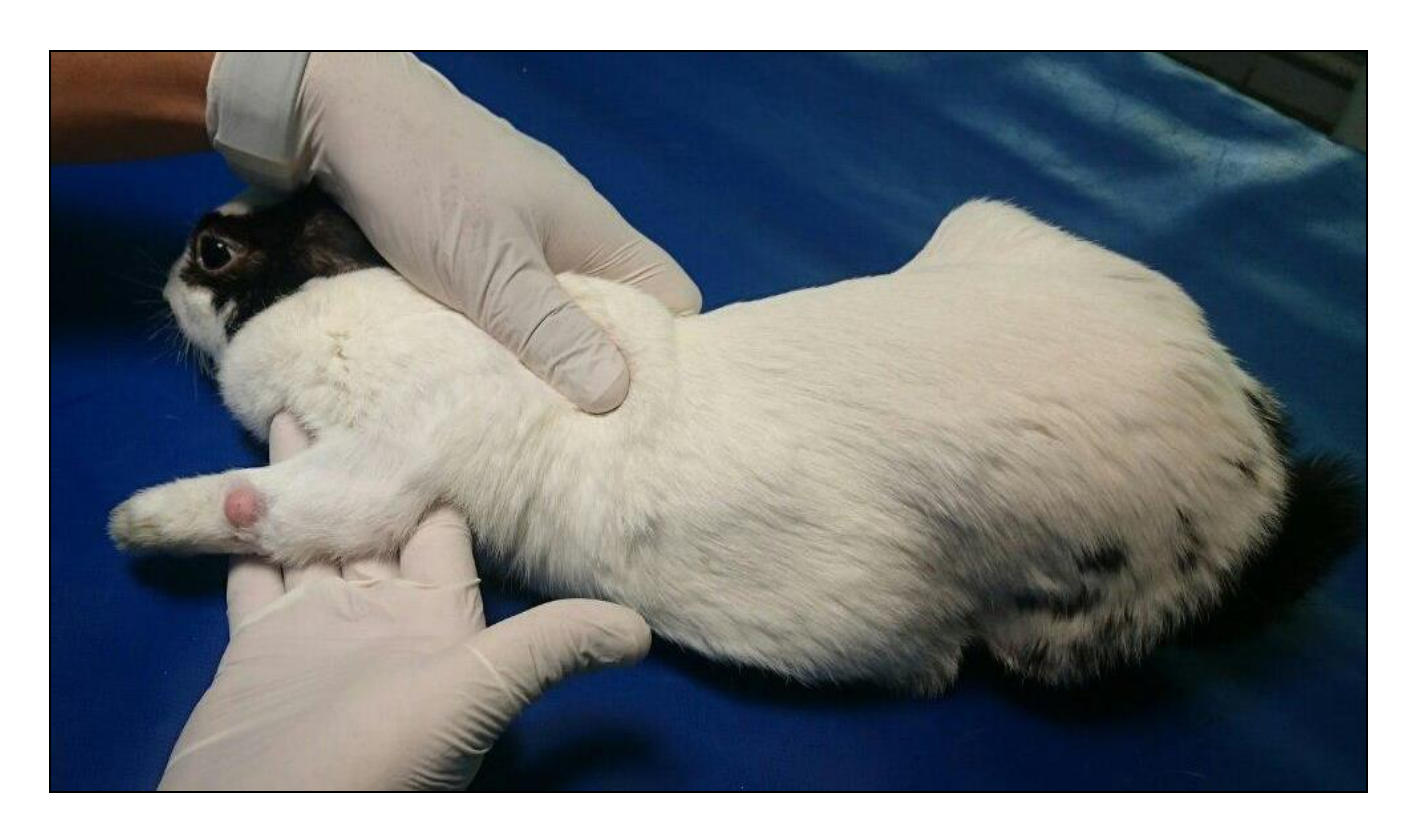
<u>Figure 1</u> : A crossbred rabbit with joint swelling and joint pain on 3 of its limbs.

the joints of the limbs. The disease is serious and can have serious consequences on the health of the animal. There is no predisposition related to rabbit age, sex or race for this disease.