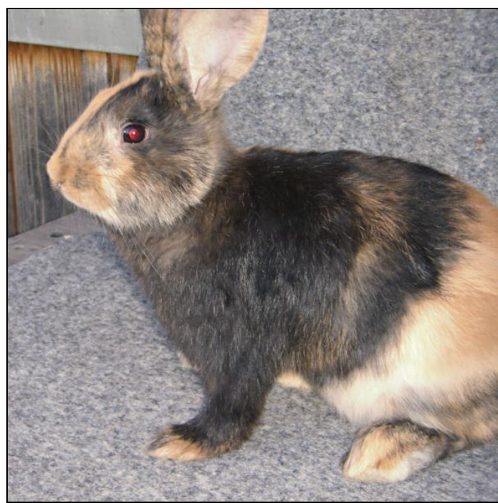
Front and lateral views of a 3 months old rabbit with lateral 0-deformation of both front limbs and possible hypermobility of the ligaments. Heaviness is suspected in this case, as this rabbit weighed already 2.7 kilos (5.9 lb.) at this young age.

the presence of physical deformities, of pain, swelling, etc. A radiographic evaluation of limb bones and joints enables to identify the cause, if primary (congenital) or secondary after an osteo-articular trauma. In order to detect lateral joint deformities, the animal should be perfectly positioned for the front view. In the case of sagittal deformation, front and side views are recommended.