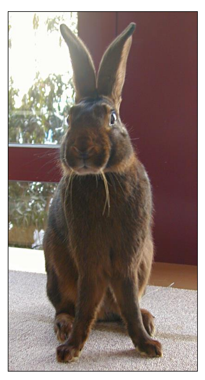
Young Belgian hare presenting a valgus misalignment (in X) of both limbs at the ulnar joint (elbow) (Picture courtesy: Michel Gruaz).

Osteoarticular deformities affect upper limbs more often than lower limbs in