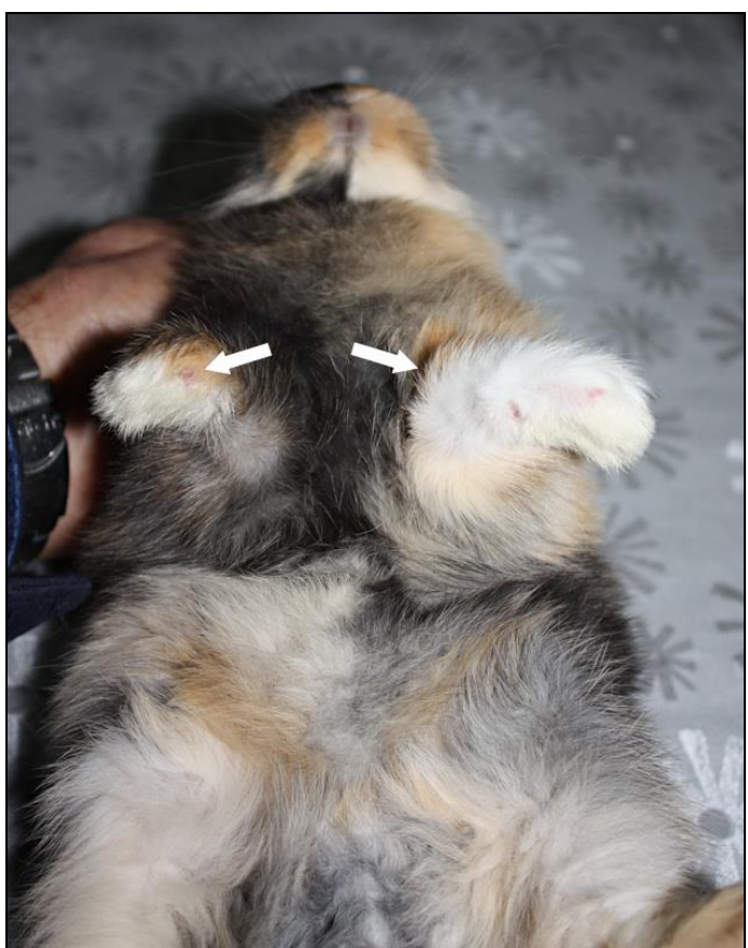
Figure 6: Young 24 day's old rabbit suffering from deformed X limbs (valgus) of both upper limbs.

"congenital dislocation" of the hip. Clin Orthop. 1966;44:221-9.