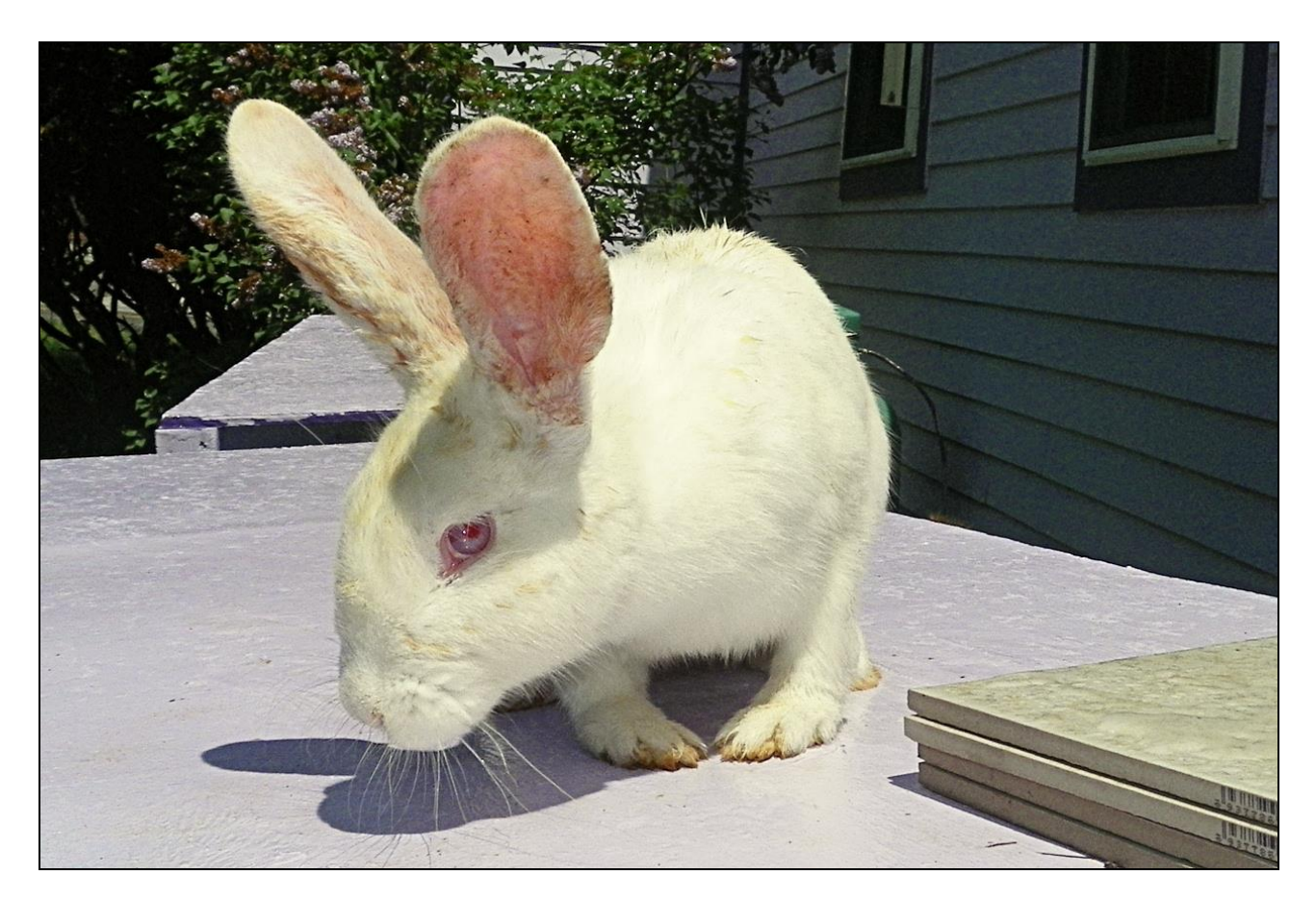
Figure 2 : Vue frontale de la lapine Néo-Zélandaise âgée de 14 semaines. La déformation des membres antérieurs est apparue à l'âge de 10 semaines.

cartilaginous tissues of long bones can lead to joint deformation, with inward or outward deviation of the limb. A wrong diet of the doe at the end of gestation (mineral or vitamin deficiencies, intoxication) can also lead to limb deformation in her offspring.