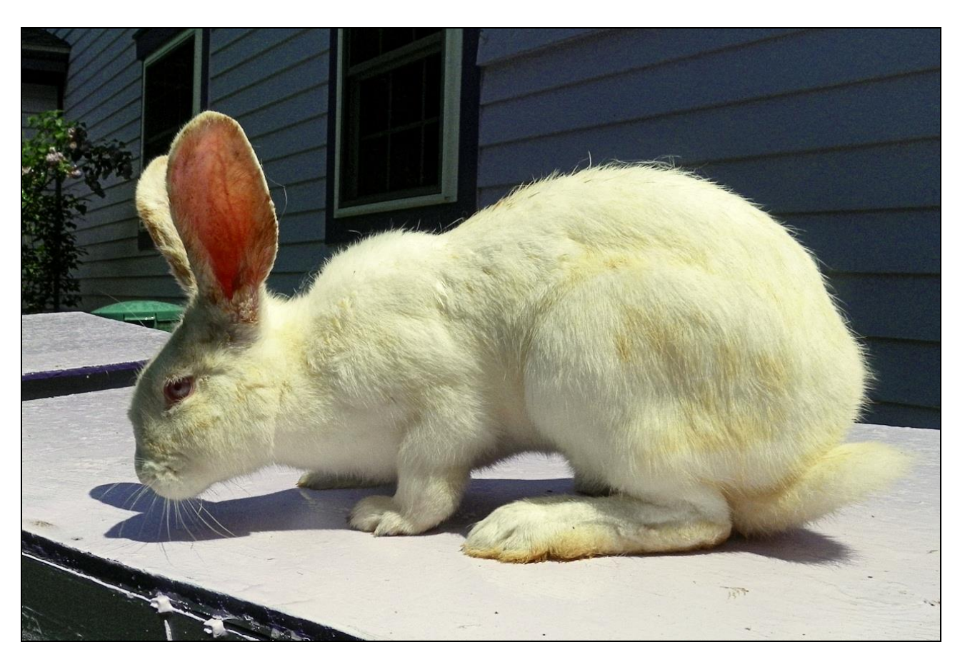
Figure 1: Side view of a New-Zealand female rabbit aged 14 weeks. The deformation of the front limbs appeared at the age of 10 weeks..

factors can lead to abnormal growth and elongation of the long bones of the limbs. In growing animals, an asymmetrical mechanical pressure (body weight) on the