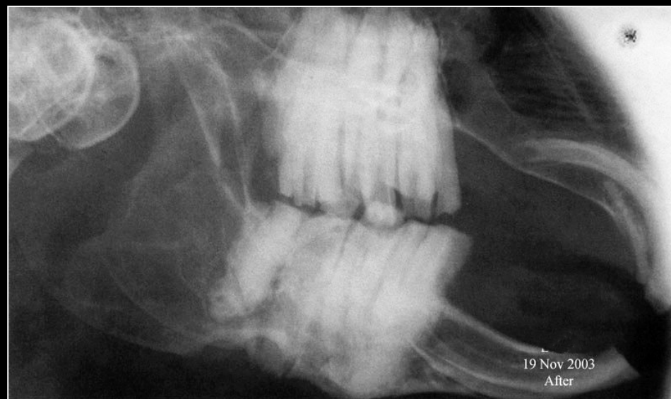
19 Nov 2003 After

Before: severe malocclusion of cheek teeth, accompanied by tooth root elongation