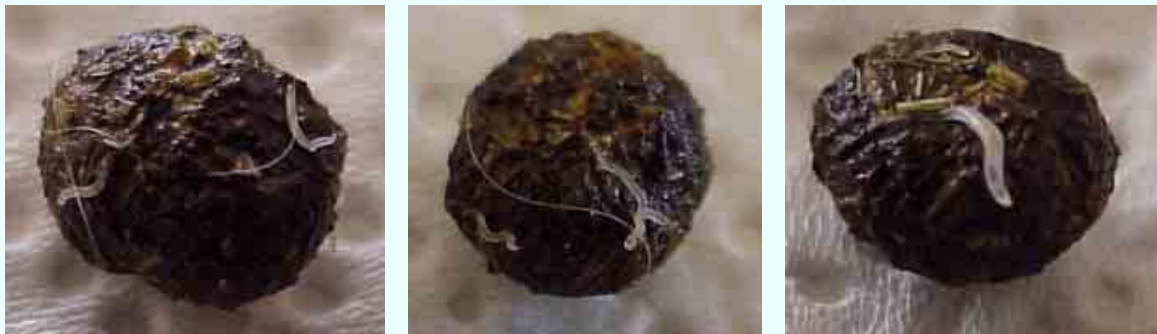
Simone van der Meij

At necropsy, Passalurus spp. worms have found in the lumen of the cecum, the crypts and mucosa of the colon. The site where the worms were located was inflammatory and presented dystrophic modifications. The most profound inflammatory and dystrophic changes were found in the cecum. Signs of vascular dystrophy were furthermore observed in the hepatic and renal parenchyma.