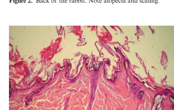
Figure 3. Rabbit skin. Note the hyperkeratosis, telogen follicles and absence of sebaceous glands. H&E stain, ×100.