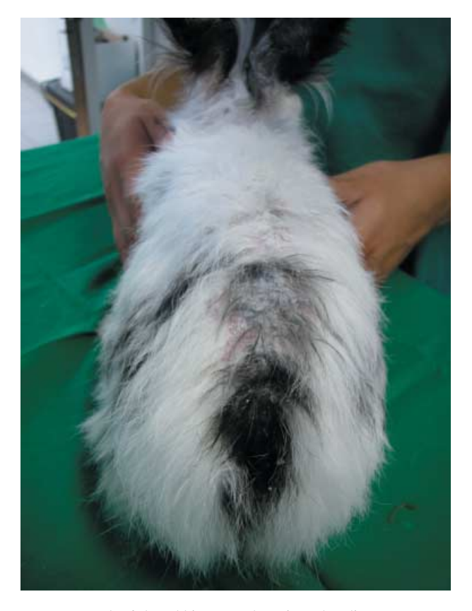
Figure 2. Back of the rabbit. Note alopecia and scaling.

This lapine case also shares many characteristics with exfoliative dermatitis in cats.<sup>7,11–18</sup> The lesions in cats consist of white scales with focal areas of alopecia, sometimes with erythema. Pruritus is usually not present. The lesions start on the head and pinnae, but become generalized. Thymomas are usually present. The histopathology is a cell-poor interface dermatitis (mild lymphocytic exocytosis, apoptosis of keratinocytes in the basal cell layer and to a lesser extent in the stratum spinosum). A recent article showed that, as