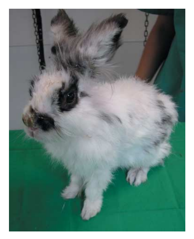
Figure 1. Five-year-old rabbit showing patchy alopecia and scaling on the head.